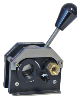
Reinforced Molded Body with Stainless Disc