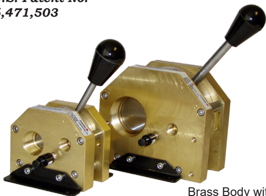
Brass Body with Stainless Disc